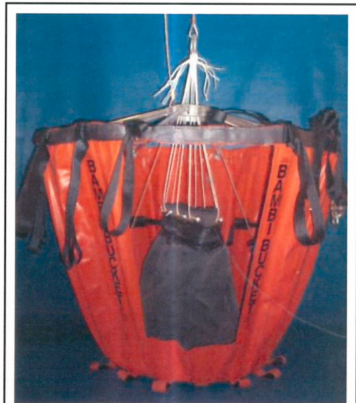
Cut away view of standard Bambi bucket.

For more copies of this manual, please contact SEI or visit our website at www.bambibucket.com for more information on these products.