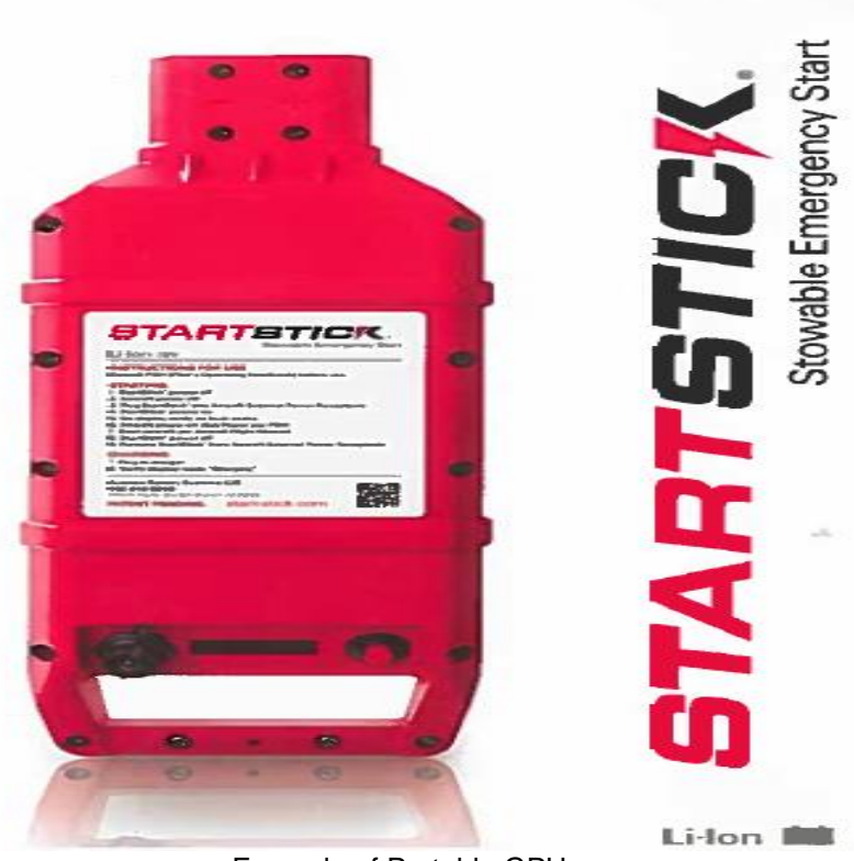
Example of Portable GPU